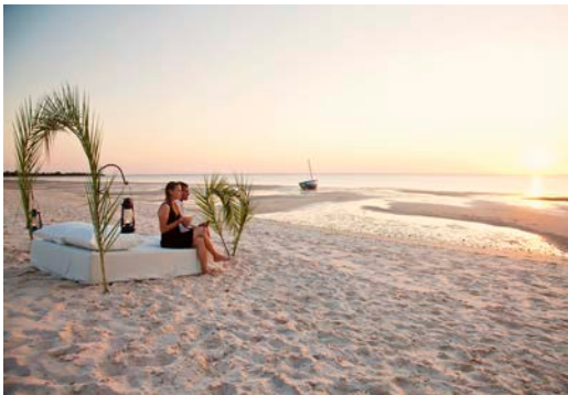
Sundowners at Azura Benguerra