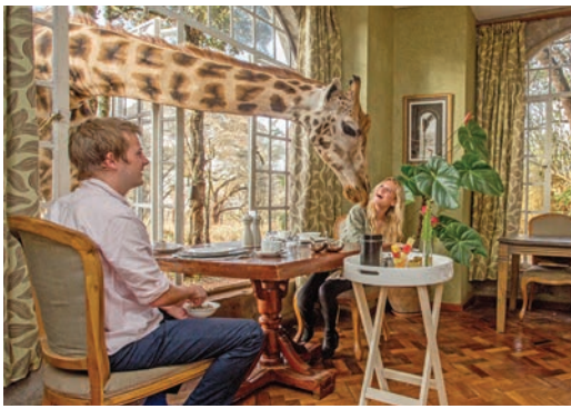
Breakfast at Giraffe Manor in Nairobi