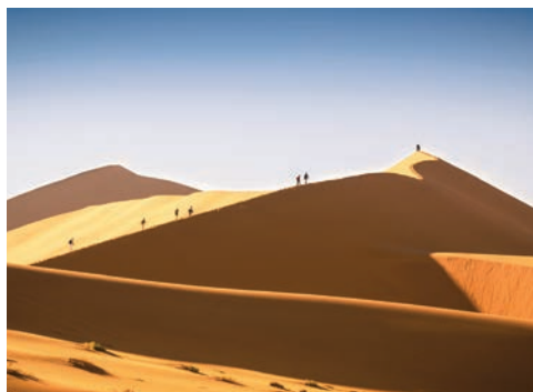
Big dune walk in Sossusvlei