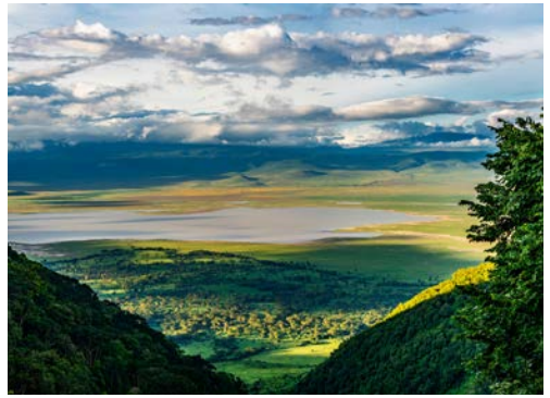
View from Ngorongoro Crater

Safari and beach are a match made in heaven, and you can't get better than Tanzania. Stay on the slopes of the Ngorongoro Crater in an incredible domed tent with panoramic views, then witness the Great Migration cross the Serengeti, keeping an eye out for the big cats which follow it.