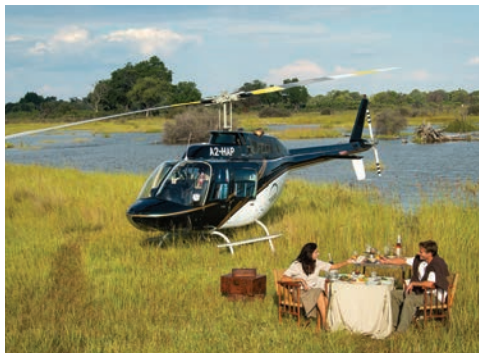
Helicopter flight and lunch in the Okavango Delta