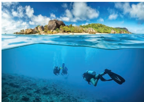
Scuba diving in the Seychelles