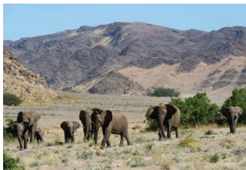
Namibia Desert elephants