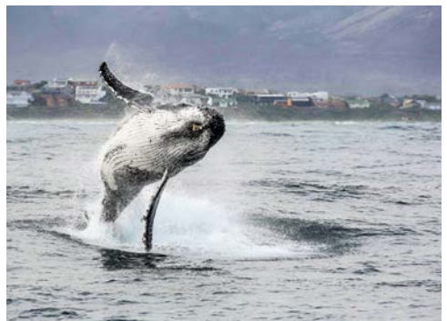
Whale watching in Hermanus