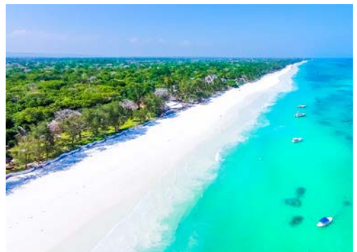
The Sands at Nomad, Diani Beach