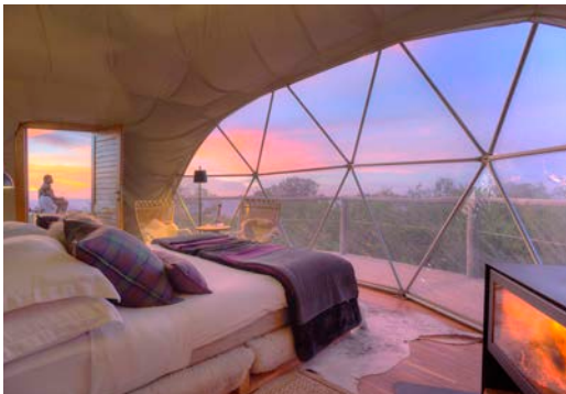
The Highlands, Ngorongoro Crater