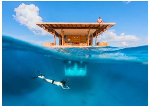
Glass underwater room at Manta Resort, Pemba