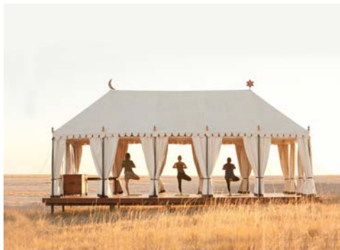
Yoga at San Camp by Natural Selection