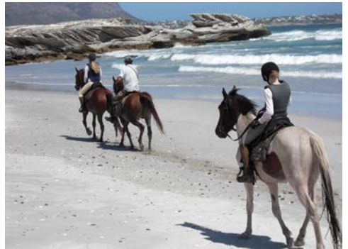
Horse riding at Birkenhead House, Hermanus