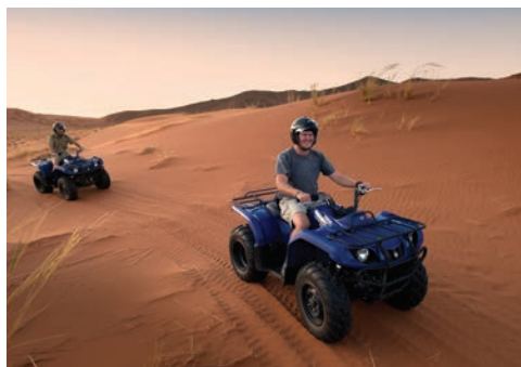
Sossusvlei Desert quad bike experience by @Beyond