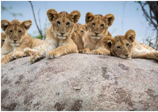
Lions in the Serengeti