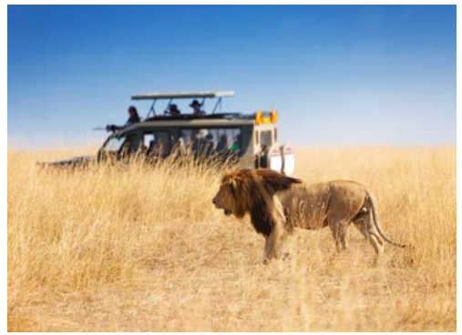
Lion on safari

The vast plains of the Masai Mara inspired Karen Blixen's 'Out of Africa' and continue to make us fall in love with Kenya today.