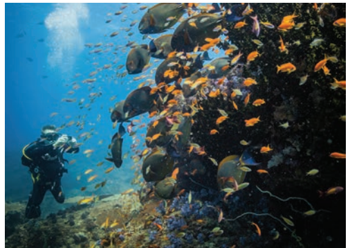
Diving at Azura Benguerra.