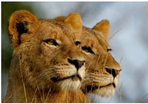
Lions at Leopard Hills Private Game Lodge