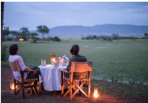
Dinner at Little Governors' Camp