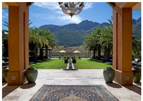
Last Word Constantia near vineyards