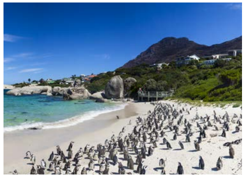
Penguins at Boulders Beach

Round your trip off in the beautiful town of Hermanus where you have the chance to spot whales frolicking in the sea, enjoy the exquisite seafood restaurants and relax in the stunning countryside before heading home.