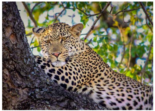
Leopard from Ngala Safari Lodge by &Beyond

This is bush to beach at its most luxurious combining the incredible wildlife of Sabi Sands with Mozambique's paradise beaches.