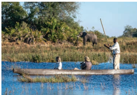
Float down the Okavango Delta in a Mokoro